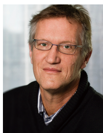
Dr. Anders Tegnell, MD, PhD, State Epidemiologist of Sweden, Public Health Agency Sweden