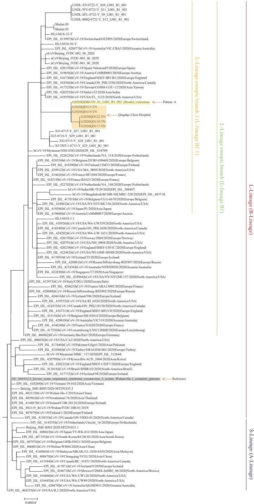
FIGURE 1. Phylogenetic tree based on the genome sequences of the COVID-19 virus. The genome of the COVID-19 virus from 5 patients infected at Qingdao Chest Hospital and Patient A were highlighted in shades of orange and yellow, respectively.