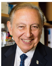
Robert C. Gallo, MD

Gudelsky Distinguished Professor in Medicine and Professor, Microbiology and Immunology