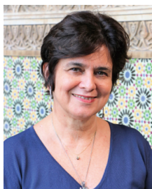
Nísia Trindade Lima, PhD President of the Oswaldo Cruz Foundation — Fiocruz