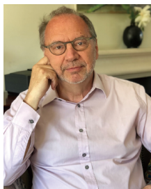
Professor Peter Piot, MD, PhD Director and Handa Professor of Global Health, London School of Hygiene & Tropical Medicine