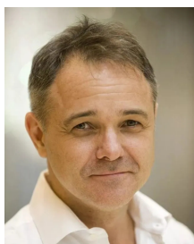
Sir Jeremy Farrar, PhD Director, Wellcome Trust