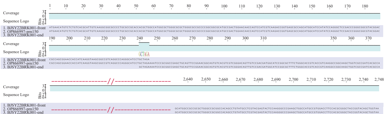
FIGURE 1. Comparison of the disrupted prn gene with the complete prn150 allele, highlighting six overlapping bases (GCTAGA) between the contigs. OP866997-prn150: intact prn150 .

Various mechanisms can result in Prn deficiency, such as mutations, deletions, and insertions within the prn gene. Cai et al. observed Prn-deficient strains in 11.7% of samples from Shanghai, characterized by