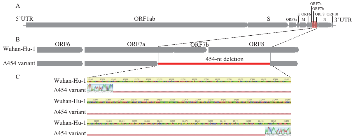
FIGURE 2. Genomic organization of human SARS-CoV-2 and the location of the 454-nt deletion ( \Delta 454 ). (A) Schematic diagram of the genomes of SARS-CoV-2 isolates Wuhan-Hu-1 (Genbank: NC_045512, GISAID: EPI_ISL_402125). (B) Magnification of genomic region (red box in panel A) showing the 454-nt deletion spanning ORF7a, ORF7b, and ORF8 (indicated by the red line). (C) Sanger sequencing results flanking the 454-nt deletion of the SARS-CoV-2 \Delta 454 variant. Abbreviation: SARS-CoV-2=severe acute respiratory syndrome coronavirus 2.

et al. A deletion in SARS - CoV - 2 ORF7 identified in COVID-19 outbreak in Uruguay. Transbound Emerg Dis 2021;68(6):3075 - 82. http://dx.doi.org/10.1111/tbed.14002 .