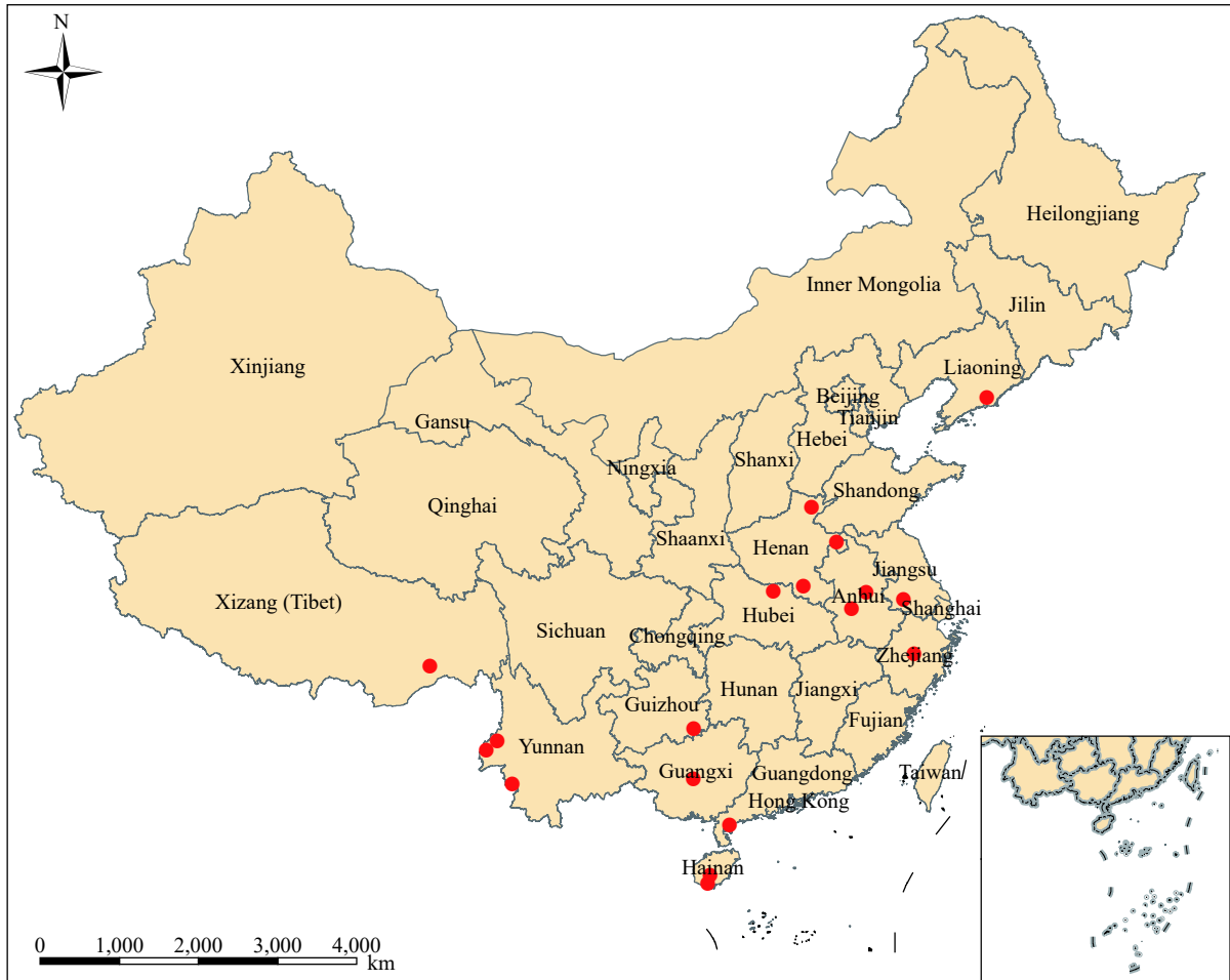
FIGURE 1. National malaria vector sentinel sites in 2018–2020, China.