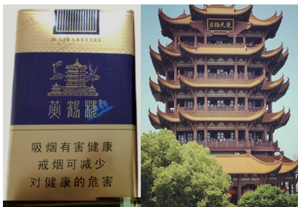
FIGURE 1. Cultural landmarks and the eponymous cigarette brands.

Left to right: Yellow Crane Tower Cigarettes, Yellow Crane Tower (Wuhan, China).