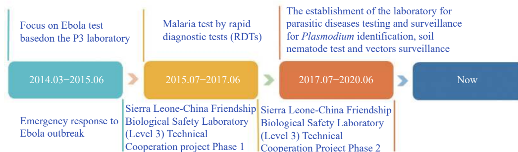
FIGURE 1. Milestones of Sierra Leone-China laboratory for parasitic diseases testing and surveillance.

The Kato-Katz technique was deployed to test the stool samples for soil-transmitted helminth infections, with the equipment and expertise of the parasitic disease laboratory in collaboration with the Chinese medical team. The results indicated that the ascaris and