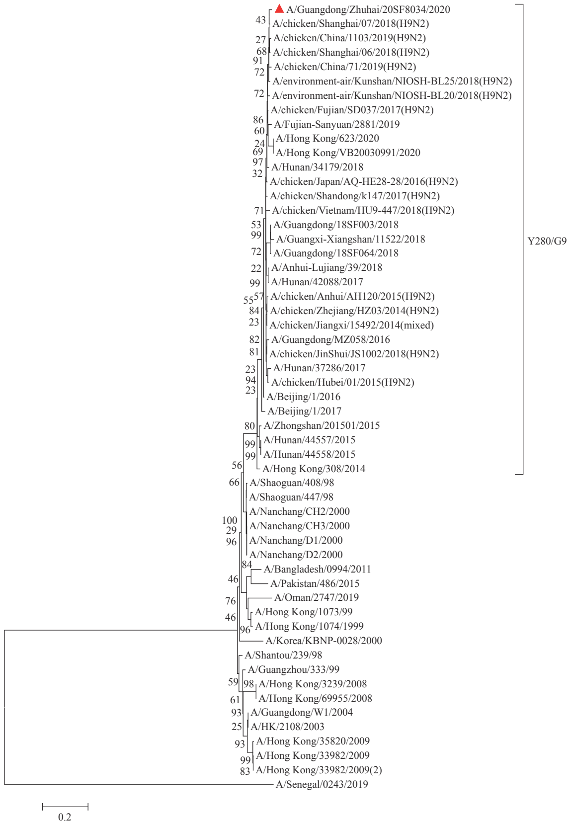
FIGURE 2. Phylogenetic tree based on neuraminidase (NA) gene sequences of the isolated virus strain A/Guangdong/Zhuhai/20SF8034/2020 (H9N2) and the reference strains using the maximum likelihood method. A red solid triangle marked the location of A/Guangdong/Zhuhai/20SF8034/2020(H9N2).